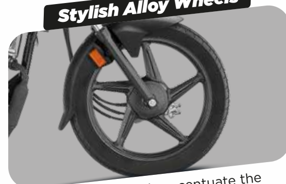
Stylish Alloy Wheels All-black alloy wheels accentuate the overall look of the bike.