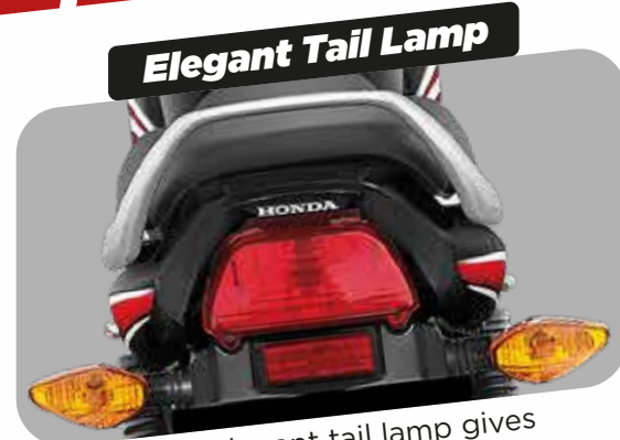
Elegant Tail Lamp Bright and elegant tail lamp gives the bike an imposing look from the back.